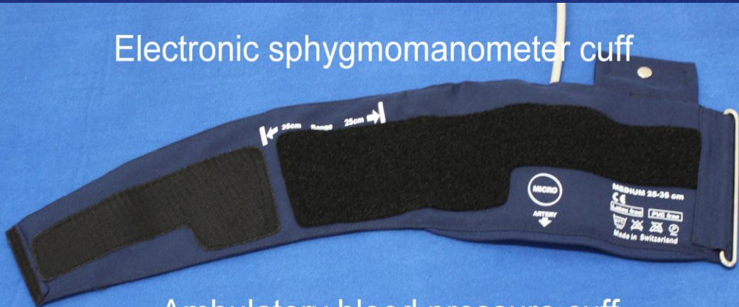
Ambulatory blood pressure cuff

Note: The cuff fabric colors can be formulated according to the company's existing fabric. The wrapping cloth's color is normally similar with color of the cuff fabric, if customers with special requirements can change the colour of the wrapping cloth.