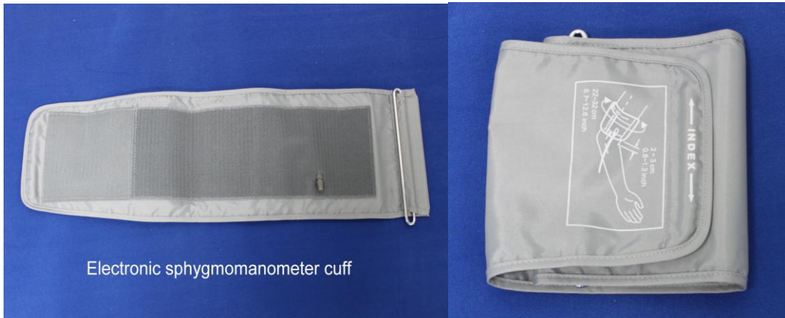
Electronic sphygmomanometer cuff