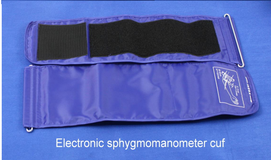
Electronic sphygmomanometer cuff