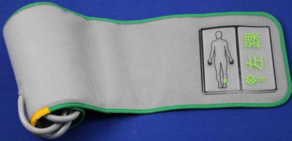
apply to high-end electronic sphygmomanometer